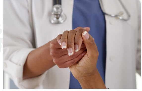
Lead ER Managing Nurse (Trinity Medical Center, Ferriday, La.)

The comfort care kits we received for survivors [that have had a forensic exam] are so needed. There isn't anything else like that for them around here. We appreciate the kits and the Helpline.